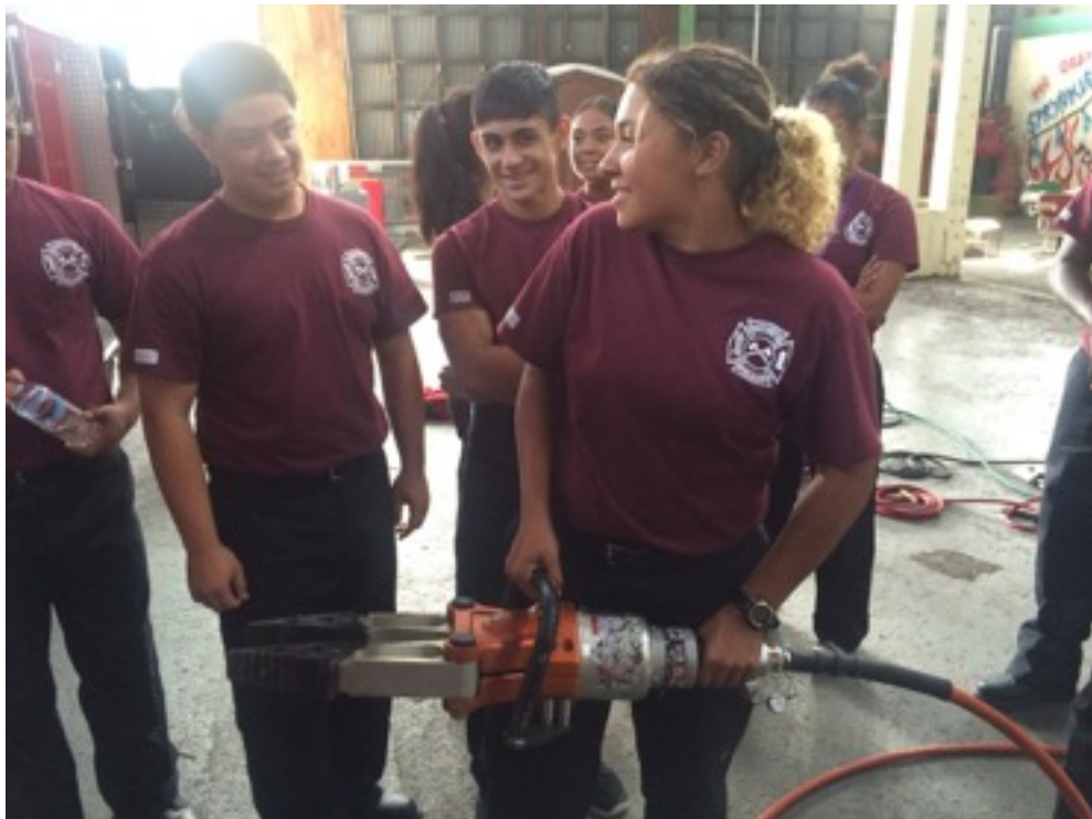
Cadets get hands on exposure to the "Jaws of Life"