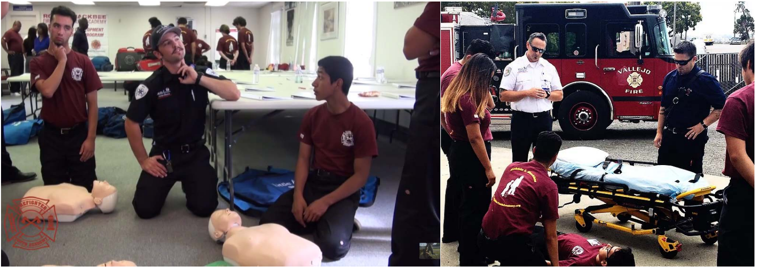
Cadets learn about Emergency Medical Services and the tools that Medic Ambulance uses everyday to save lives.