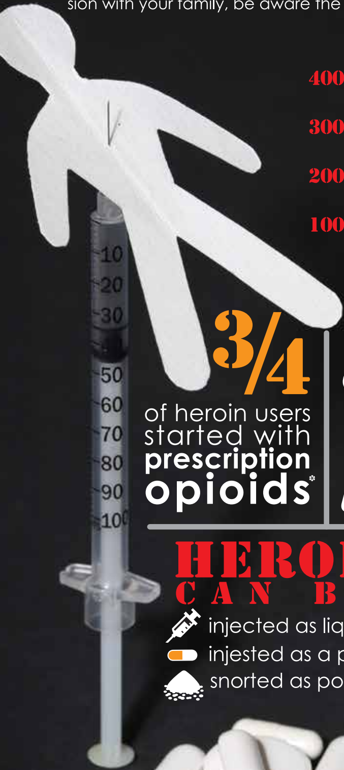
ST. CHARLES COUNTY AMBULANCE DISTRICT HEROIN & OPIOID OVERDOSE CALL VOLUME

Getting a handle on this epidemic will require close coordination between law enforcement, government officials, healthcare providers and, most importantly, families in our community. Have the discussion with your family, be aware the warning signs and know where to turn for help.